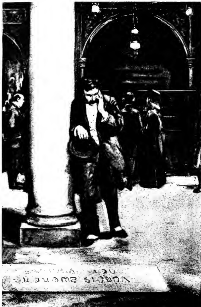
The Tomb of Adam